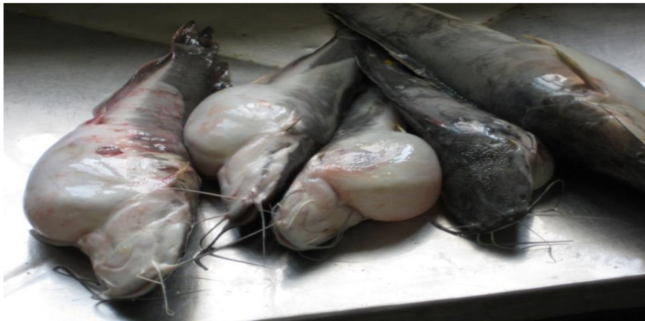
Plate 1: Marked ascites [black arrow] caused by Aeromonas hydrophila in moribund catfishes.