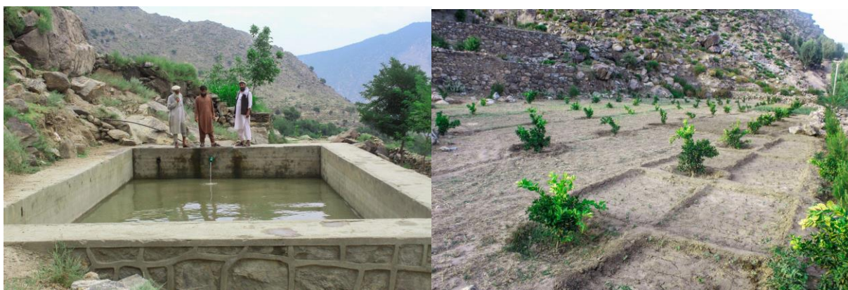
Figure 3. A water reservoir constructed in Gundel village and an agroforestry plot in Tarara village of Manogi district.

29,045 households directly benefited from the restoration interventions from 2018-2023. Similar studies show that planting trees and establishing forests has supported alternative livelihood sources for communities and alleviated land degradation (Gouhari et al., 2021). The communities are enjoying improved food security through agroforestry practices (170,000 saplings, 3,224 households), dairy value chain toolkits (500 households), backyard poultry farms (1,200 households), and cash for work (600 households).