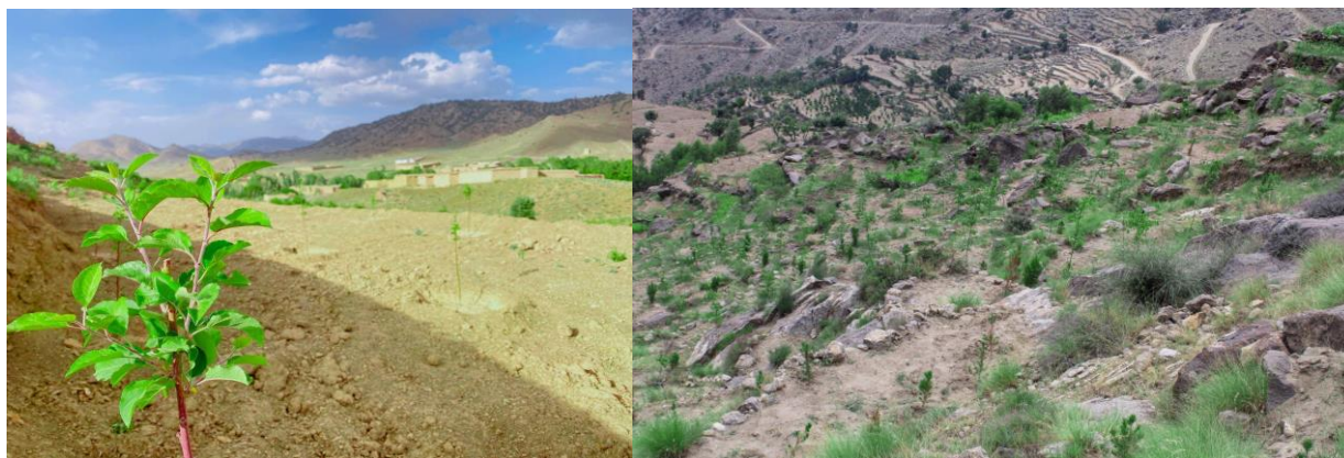
Figure 2. Plantation of walnut saplings, Sabray village through Sundray FMA in Kunar province

Also, restoring 17,630 ha through improved management practices like natural regeneration, halting, cuttings, grazing and patrolling in degraded forests in Pakiya, Kunar and Badghis provinces to increase biodiversity conservation and carbon sequestration. HCVF and rangeland restoration have exceeded initially planned targets, mainly due to the commitment of the FMA and RMA, who realized the value of restoration for their lands and lives amidst the challenges they face, including from the changing climate. Recognizing the importance of restoring both farmland and forests is crucial for sustaining life and mitigating the effects of the climate crisis (Khan et al., 2024).