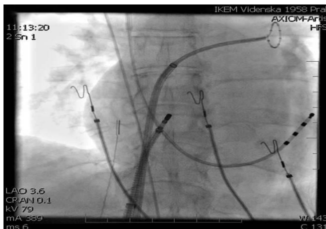
Figure 2: Fluoroscopic PA view with Lasso catheter in transseptal sheath placed at LSPV and quadripolar CS catheter in place with Artisan robotic catheter navigating through the Interatrial septum(IAS). Note Intracardiac echocardiography) ICE catheter in RA (abbreviations in text).

Demographic Data: The mean age was significantly lower in Robot group ( 46.1 \pm 11.0 years) compared to Carto group ( 54.5 \pm 8.0 years) and group NavX ( 53.7 \pm 12.2 years), P < 0.001 . The percentage of male patients was significantly higher in Carto group (70%) and NavX group (65%) compared to Robot group (45.7%), P < 0.05 .