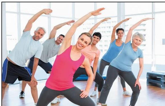
Figure 2: Fitness Exercise.

The bottom line of exercise and physical activity are a great way to feel better, gain health benefits and have fun. If you want to lose weight or meet specific fitness goals, you may need to exercise more. Remember to check with your doctor before starting a new exercise programme, especially if you have any health concerns. A sedentary lifestyle does the opposite, increasing the chances of becoming overweight and developing a number of chronic diseases (WHO, 2009).