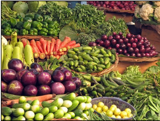
Figure 4: Fruits and Vegetables.